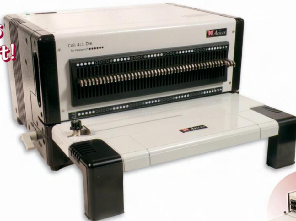
FlexiPunch-E (Electric Version)