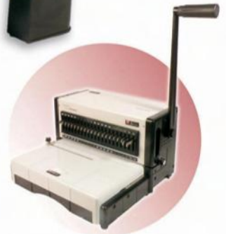
FlexiPunch-M (Manual Version)