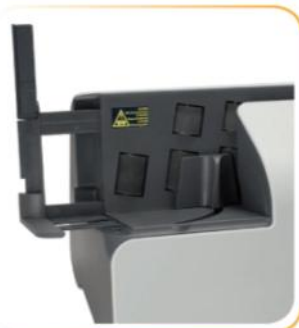
Easy-to-use support arm extends to hold large envelopes