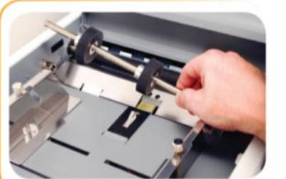
Removable Feed Wheels