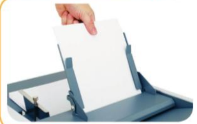
Optional Multi-Sheet Feeder