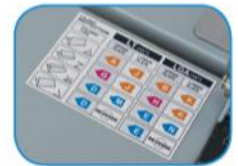
Clearly marked fold guide for quick and easy setup

The FD 300 Office Desktop Folder provides an economical solution for low-volume folding projects. This compact folder processes 11" and 14" paper at speeds up to 7,400 sheets per hour, and is clearly marked for 4 common fold settings.