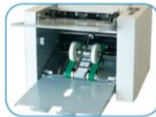
Output conveyor for neat & sequential stacking