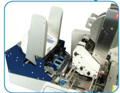
FD 282-10 Heavy Duty Friction Feeder