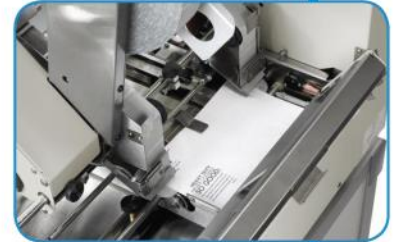
Edge tabbing both sides of a mailpiece simultaneously