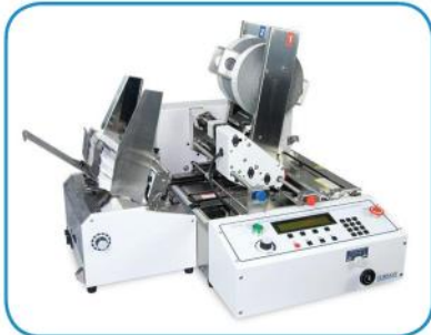
FD 282SF - FD 282 Tabber plus Medium Volume Synchronized Feeder