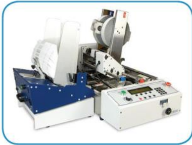
FD 282HF - FD 282 Tabber plus High Volume Heavy-Duty Friction Feeder