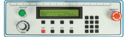
Control panel with LCD Display and 4 programmable jobs