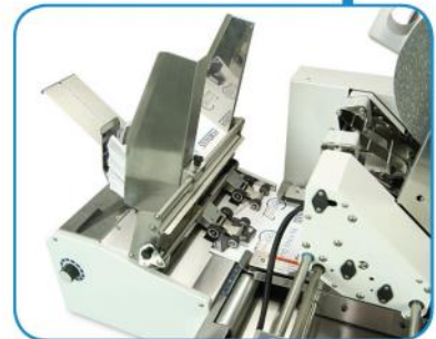
FD 282-05 Medium Duty Synchronized Feeder