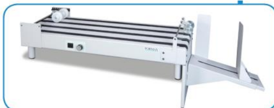
FD 282-30 Drop Stacking Conveyor