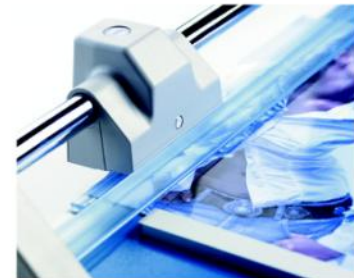
Automatic clamp holds work securely and prevents shifting while trimming.