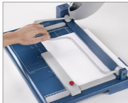
Ratchet-locking paper clamp provides even pressure along the entire cutting surface to hold work securely.