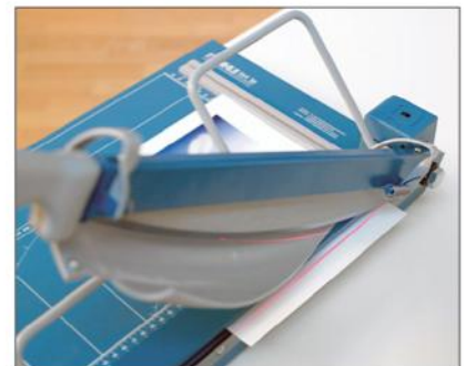
Laser guide illuminates the entire cutting line to show exactly where the cut will be.