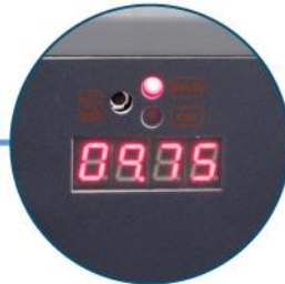
LED Back Gauge Display Get a precise cut using standard or metric settings