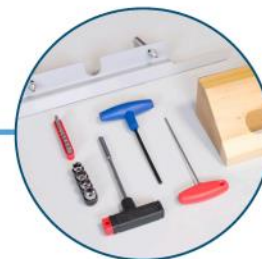
Blade Change Safety Tool Kit Change blades safely and easily, and make adjustments