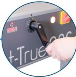
Manual Back Gauge Adjustment Fine-tune control for precision cutting