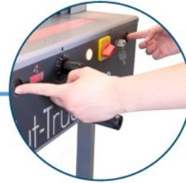
Two-Hand Operation Safely engages clamp and blade, keeping hands away from the cutting area