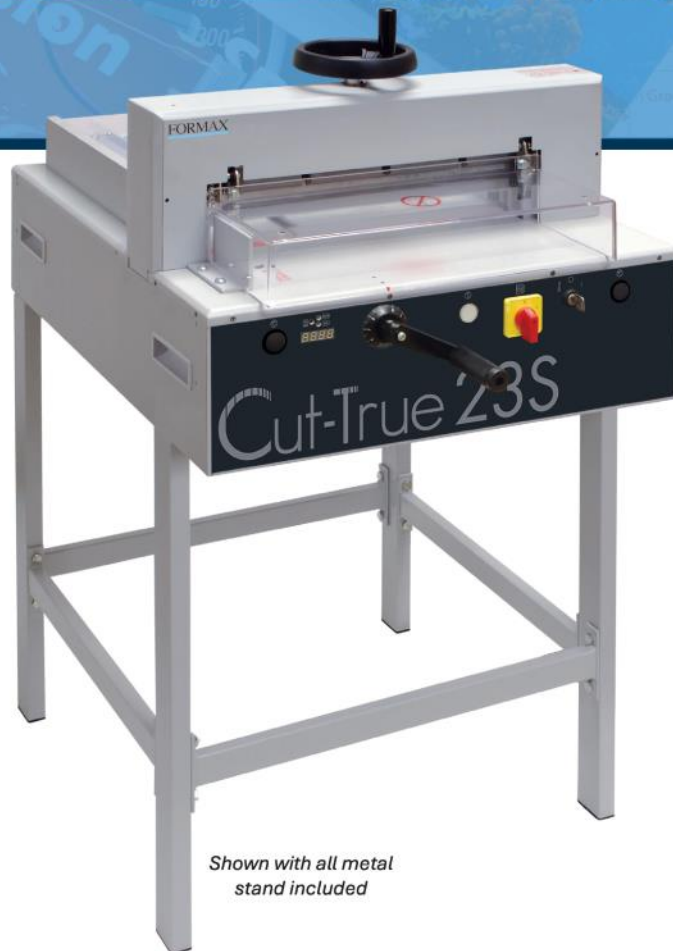
Shown with all metal stand included