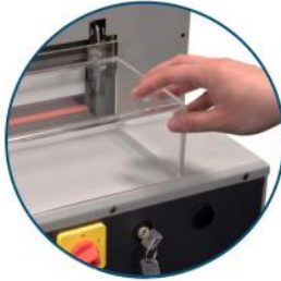
Electronically Controlled Safety Cover Immediately stops operation if the cover is lifted

The Formax Cut-True 23S Electric Paper Cutter offers precision cutting for paper stacks up to 16.9" wide and up to 1.75" high. This semi-automatic cutter requires very little effort, with its electronically-controlled two-button operation, and doesn't sacrifice safety for accuracy. It features an electronically-controlled front safety cover, a safety lock with key, an easy to use blade change safety tool, and a wooden paper push for safe alignment. The Cut-True 23S is ideal for transforming brochures, invitations and more, with crisp, accurate cuts, and is a welcome addition to print shops and in-plant finishing.