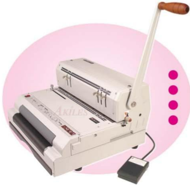
CoilMac-ECI (STANDARD version)