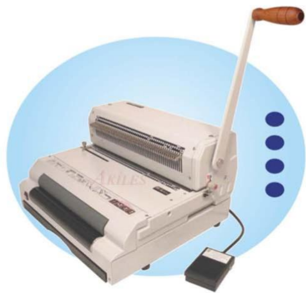
CoilMac-ECI+ (PLUS version)