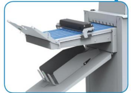
Belt outfeed stacker for folded pieces, and catch tray for crease-only jobs, both are standard