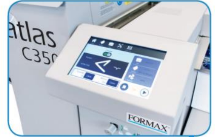
Color touchscreen control panel features bold icons and simple automatic setup

** Most perfect bound book covers cannot be creased in a single pass