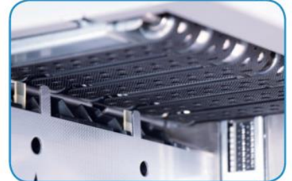
Powerful vacuum top-feed system and optical sensors control sheet separation and make adjustments on-the-fly