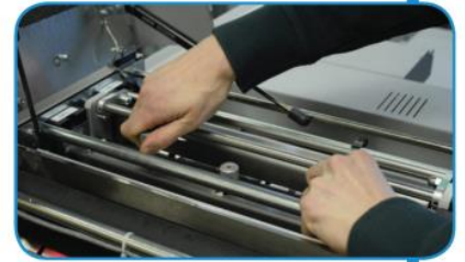
The quick release mechanism allows users to change blades in under 30 seconds, without the need for tools