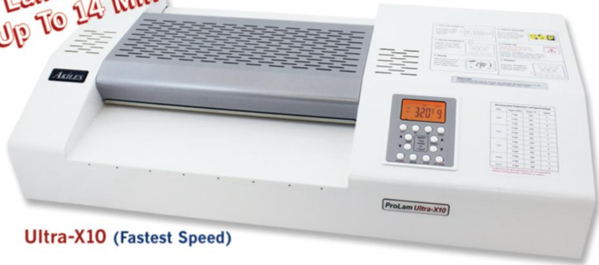
Ultra-X10 (Fastest Speed)