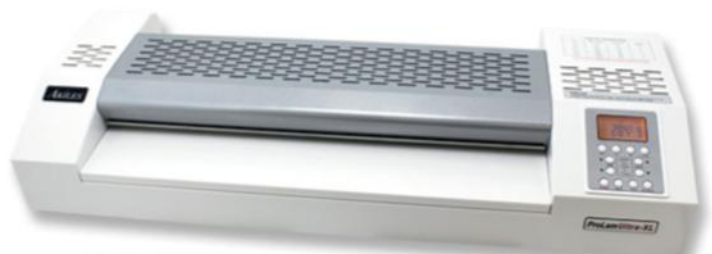
Ultra-XL (Extra Large 18.9" Opening)