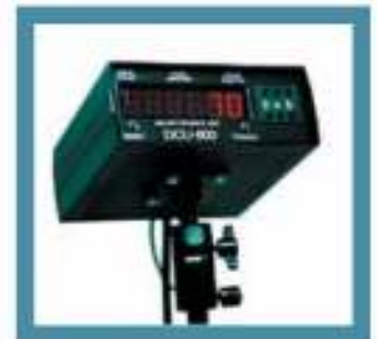
Baum Batch Counter

The Baum Batch Counter provides a vacuum interrupt to create a gap between batches on air feed models. A lift-wheel interrupt model is available for either air or friction feed models.