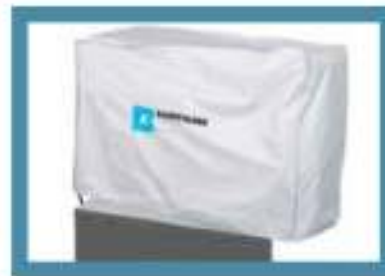
714XLT Dust Cover

The dust cover protects your machine from paper dust and other environmental factors.