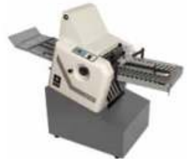
714XLT 8-Page, alone