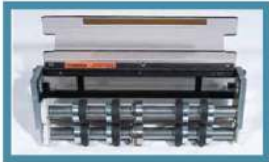
Ultracore Perf Score Attachment