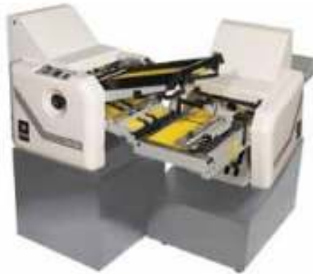
714XLT 8-Page, right-angle

The 714XLT Right Angle features more effective stack removal for higher productivity, new positive drive cross-carrier design, and "up & down" folding position capability.