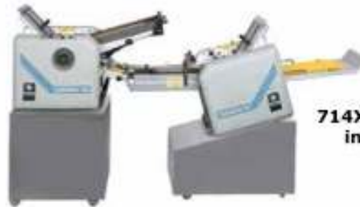
714XLT 8-Page, in tandem

The 714XLT includes a helpful folding chart [domestic or metric] on the delivery tray that shows seven types of folds: Single fold, Letter fold, Fan fold, French fold, Double-parallel fold, Double-letter fold and Engineering fold, with a few simple settings.